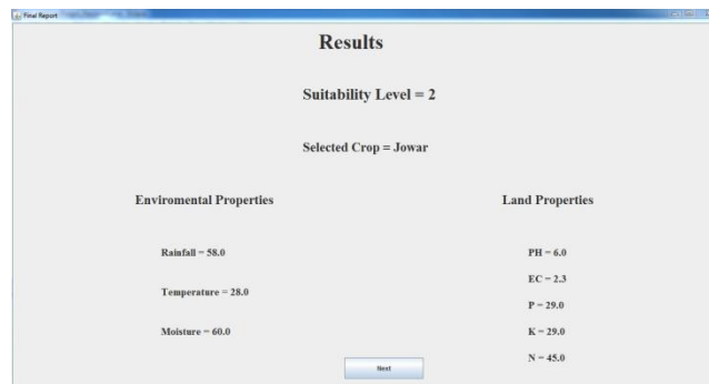
Figure 1: Soil suitability by Hybrid Machine Learning model

Actual output generated by this system is in terms of current suitability level and expected improvements required to achieve potential suitability level. If the lagging parameters are the parameters which can be modified artificially and we can achieve the target of expected value shown in Fig. 2 then, potential suitability level = ++ current suitability level. Output for the sample case is shown below: