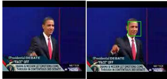
Fig 1. Number of Lead with Detected Face.