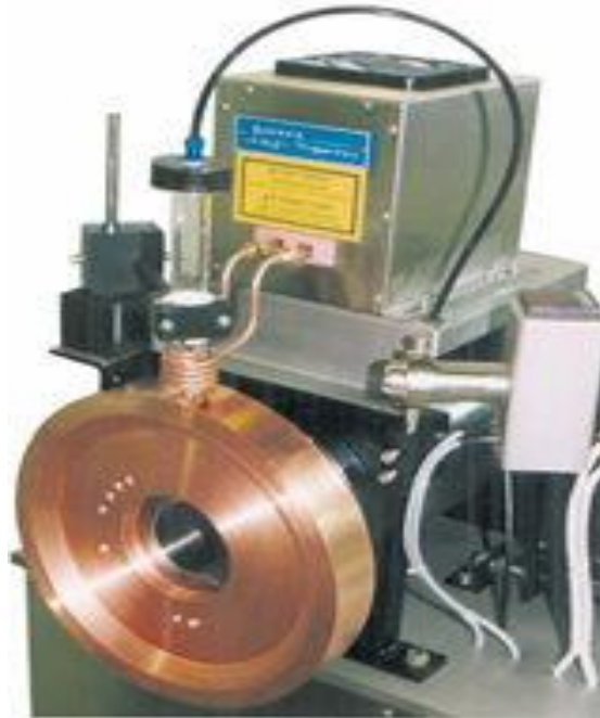
Fig. 1 Melt-spinning Machine

Melt-spinning is a widely used production method for rapidly solidifying materials as well as preparing amorphous metallic ribbon [2-3]. In order to prepare amorphous of Fe_{73.5-x}Cr_xCu_1Nb_3Si_{13.5}B_9 alloys with x = 1, 2, 3, 4, 5, 6, 7, 8, 9, 10, 12.5, 15 and 17.5 , a melt spinning system has been used. The arc melted master alloy was crashed into small pieces and put inside the quartz tube crucible for re-melting by induction furnace using a medium frequency generator with a maximum power of 25 kW at a nominal frequency of 10 kHz.