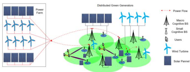
Fig. 2. Green supply chain for cognitive radio networks [15]

Distributed power generators, starting from users known as prosumers (consumer of a product of service that also produces it), are at the forefront of the development to harness power micro-networks. Hence, telecommunication manufacturers such as Nokia, Siemens, Huawei and Ericsson have designed and built stations outside of the network that are powered by green energies to reduce the OPEX of mobile networks in rural areas [38]. The general energy consumption of the wireless network depends on the power generated by the environment, the storage capacity of the battery, the traffic demands and the conditions of the wireless channel [39]. which are all dynamic processes as shown in Figure 2.